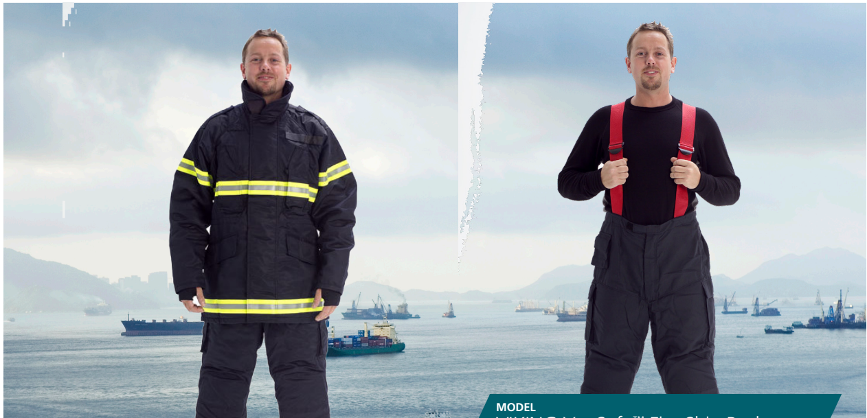
MODEL VIKING YouSafe™ Fire Ship Package+