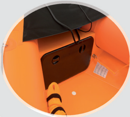
BOW LOCKER FOR EQUIPMENT