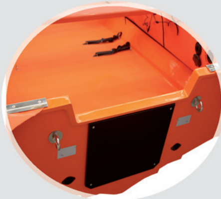
POLYPROPYLENE TRANSOM PLATE