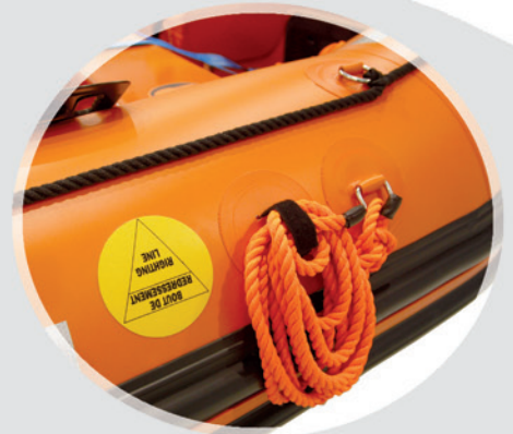
"D" RING WITH RIGGING LINE