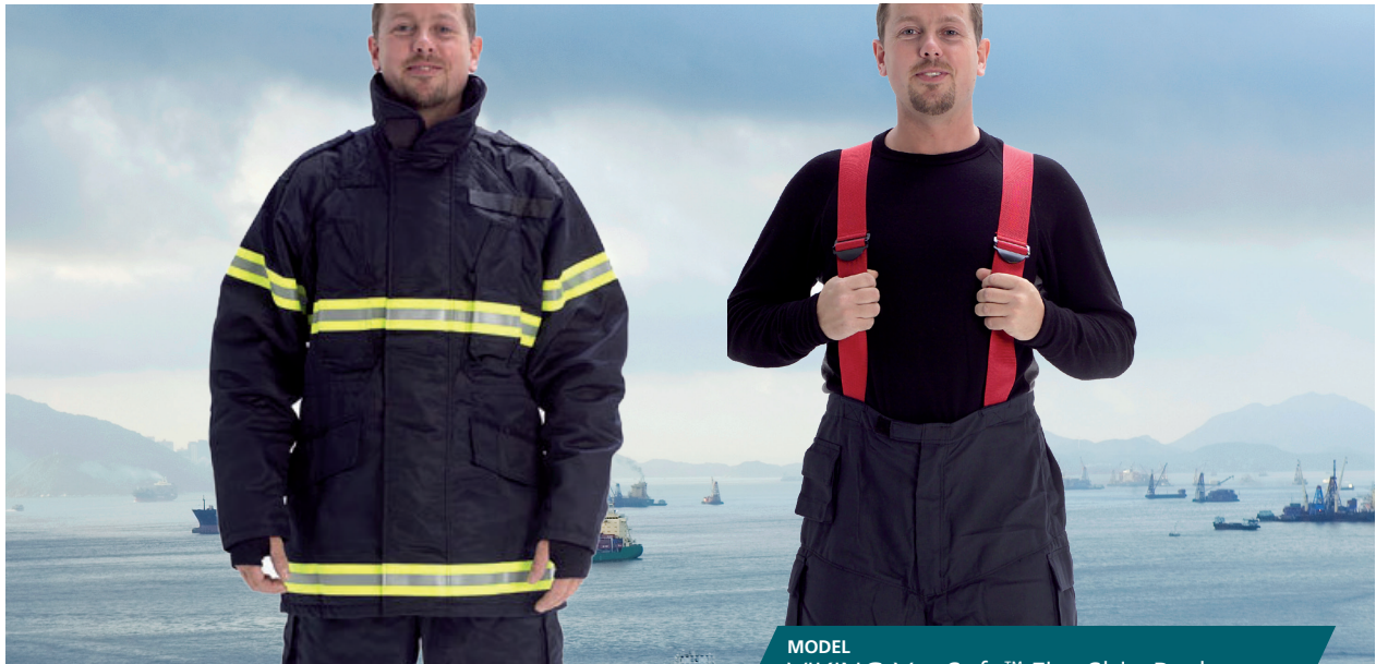
MODEL VIKING YouSafe™ Fire Ship Package+